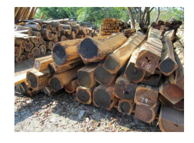
Chakte viga logs