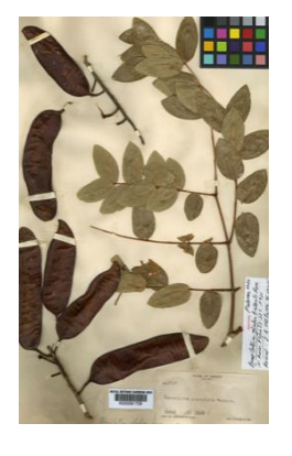
Chakte viga leaves and pods