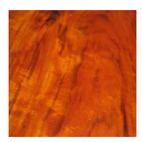
Chakte viga wood

Here is a summary of the characteristics of Chakte viga (also known as Paela, and Aripin):