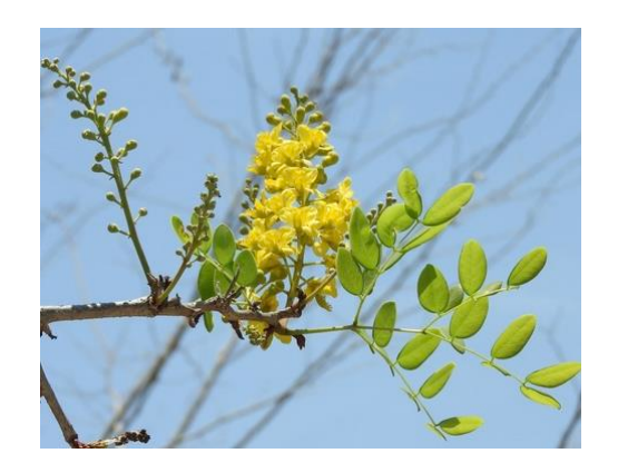
Chakte viga leaves and flowers