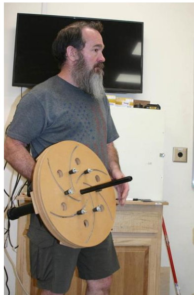
Segmented Turnings Jig