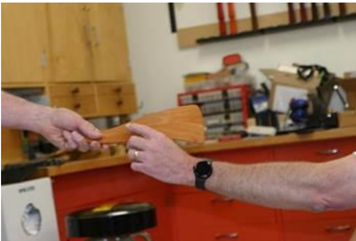
Laminated Salad Forks